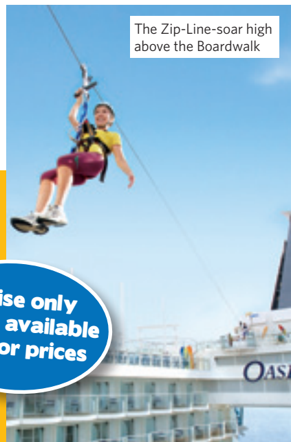
The Zip-Line-soar high above the Boardwalk