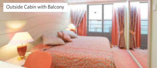
Outside Cabin with Balcony