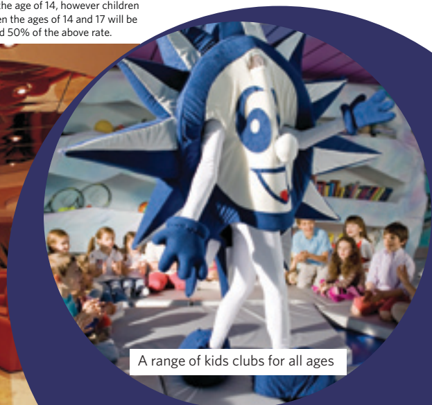
A range of kids clubs for all ages

Terms & Conditions: www.cruise.co.uk are approved agents of the cruise lines featured. All fares are per person in sterling based on 2 adults sharing the lowest grade of cabin, within applicable category and available at the time of going to print. Individual Cruise Line's Terms and Conditions apply. A small cover charge will apply in certain speciality restaurants. All prices are correct at time of going to print, however customers are advised to confirm by calling www.cruise.co.uk. E&OE. All cruises will be hosted subject to personal circumstances permitting and we cannot be held responsible for the cancellation of the hosts for this reason. In the unlikely event that the hosts have to cancel, a suitable replacement will, where possible, be found. Service charge policy - All on board services offered to MSC guests are subject to a mandatory service charge which will be billed to the guest's account. Payment will only be requested at the end of the cruise and will depend on the number of days services provided. *Children who are eligible to cruise free are subject to port dues of £105 each. Printed July 2011.