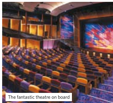
The fantastic theatre on board