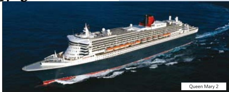
Queen Mary 2

Ships sail along the tranquil Oslofjord to reach Oslo, a spectacular city surrounded by snow-capped mountains and rolling green hills. Founded in 1050, it has been Norway's capital since the end of the 11th