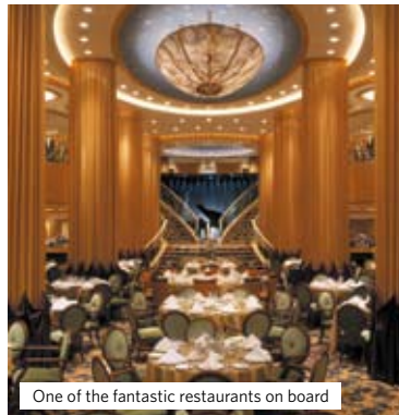
One of the fantastic restaurants on board