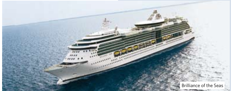
Brilliance of the Seas