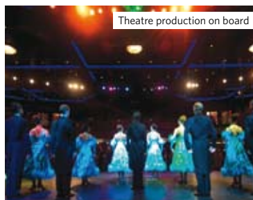
Theatre production on board