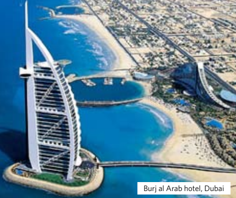
Burj al Arab hotel, Dubai