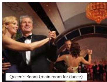
Queen's Room (main room for dance)

century. The modern city is an eclectic mix of ancient castles, frescoed 18th century houses, vast parks and glittering lakes.